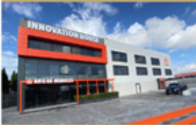
Innovation House R&D Center

E-Mail: sales@gurme212.com Phone: +90 236 427 22 23 (pbx)