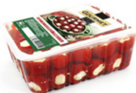
Feta & Cream Cheese Stuffed Red Cherry Peppers