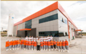
Frozen&Chilled Foods Factory