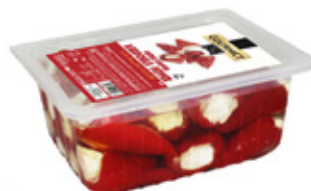
Feta & Cream Cheese Stuffed Kardoula Peppers