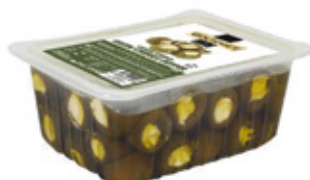
Feta & Cream Cheese Stuffed Green Cherry Peppers