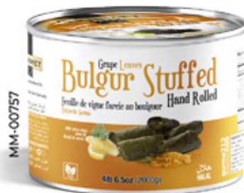
Bulgur Stuffed Grape Leaves