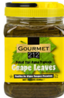
Tokat Type Folded Grape Leaves