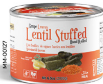
Lentil Stuffed Grape Leaves