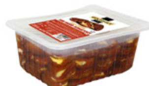
Feta & Cream Cheese Stuffed Sun Dried Tomatoes