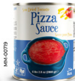
Sun Dried Tomato Pizza Sauce