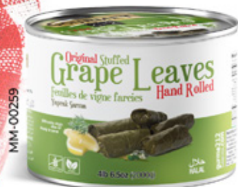
Original Greek Type Stuffed Grape Leaves