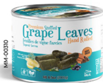
Premium Turkish Type Stuffed Grape Leaves