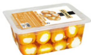
Feta & Cream Cheese Stuffed Yellow Cherry Peppers