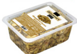
Chargrilled Oyster Mushroom