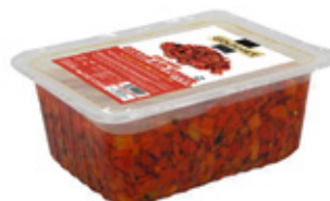
Semi Dried Grilled Red Pepper