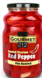
Roasted Red Pepper