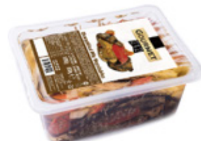
Chargrilled Mix Vegetables