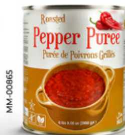
Roasted Pepper Puree