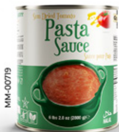
Sun Dried Tomato Pasta Sauce