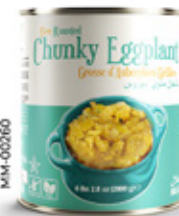
Roasted Eggplant Puree