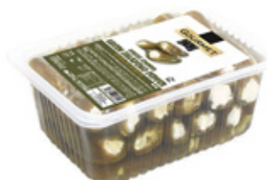
Feta & Cream Cheese Stuffed Jalapeno Peppers