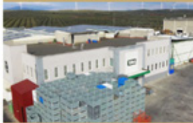
Canned Foods Factory

E-Mail: europe@gurme212.com Phone: +49 (0) 421 87834307