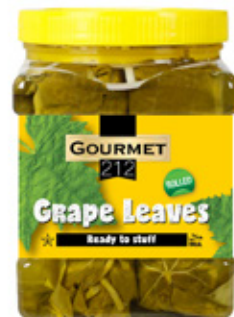
Tokat Type Rolled Grape Leaves