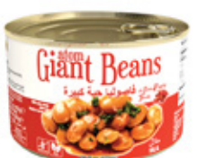
Atom Giant Beans