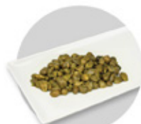
Capers in Brine GURME463A - GURME470