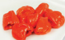
South African Style