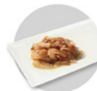
Caramelized Onion GURMESP-612