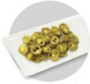
Green Sliced EKO406B