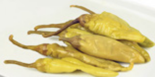
3-7 cm Whole Macedonian Pepper