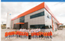
Site 1 11.000m 2