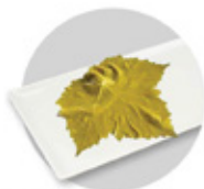
Tokat Type Grape Leaves GURMESP-540T