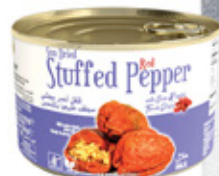
Sun Dried Stuffed Red Pepper