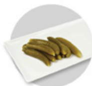
Cubuk Cucumber Pickles GURME464