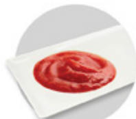
Pizza Sauce GURME712 - GURME712T