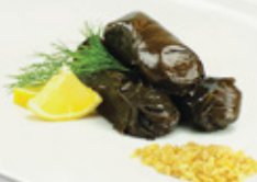
Bulgur Stuffed Grape Leaves