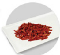
Marinated Sun Dried Tomato Strips