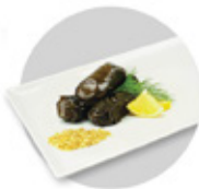
Bulgur Stuffed GURME534