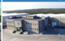
Site 3 10.000m 2