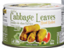
Stuffed Cabbage Leaves