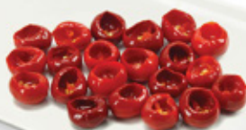
North African Style