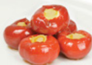
Hummus Stuffed Cherry