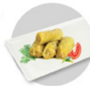
Stuffed Cabbage Leaves GURME535