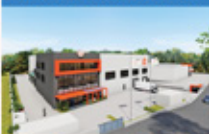
Site 2 5.000m 2