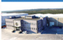
Site 4 10.000m 2