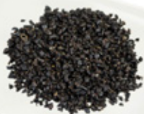
Fine Diced Black Olives