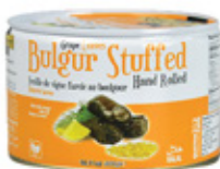
Bulgur Stuffed Grape Leaves