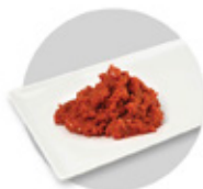
Red Puree GURMESP-435