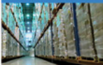
Site 5 5000 tons