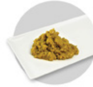
Green Puree EKOSP733