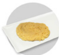
Chickpea Puree GURME723A