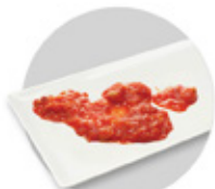
Tomato Passata GURME713