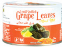
Lentil Stuffed Grape Leaves