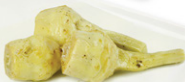
Roma Style with Stem