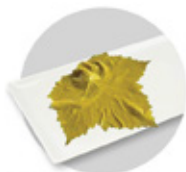
Manisa Type Grape Leaves GURME543US - GURME5444 - GURME542A - GURME540