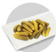
Baby Cucumber Pickles GURME467K - GURME465