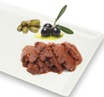
Capers Black Olive Dip