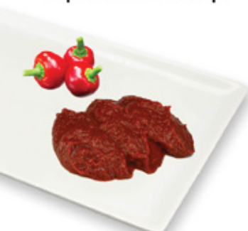
Cherry Pepper Dip