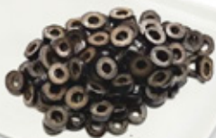
Sliced Black Olives