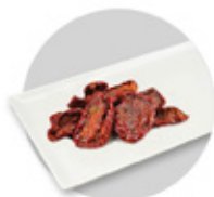
Marinated Sun Dried Tomato Halves