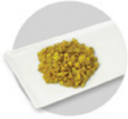
Green Diced EKO408B