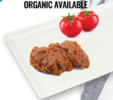
Roasted Tomato Dip