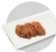
Roasted Tomato Dip GURMESP-700