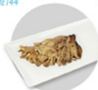
Chargrilled Oyster Mushroom GURMESP-625