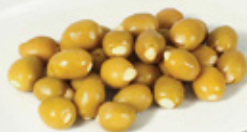
Almond Stuffed Green Olives