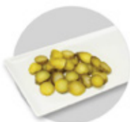
Sliced Cucumber Pickles GURME462GRP