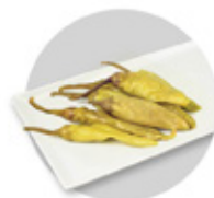
Macedonian Pepper GURME144