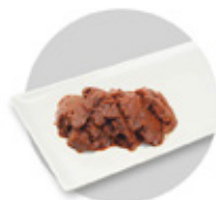
Capers Black Olive Dip GURMESP-702