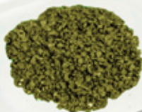
Fine Diced Green Olives