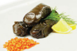
Lentil Stuffed Grape Leaves