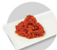
Roasted Tomato Puree GURMESP-734