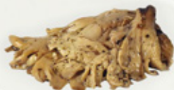
Chargrilled Oyster Mushroom