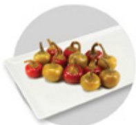
Red - Green