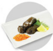
Lentil Stuffed GURME533