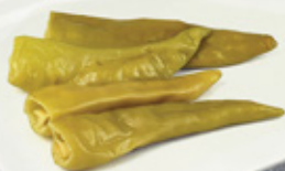
7-9 cm Pitted Macedonian Pepper