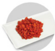
Red Diced GURMESP-434