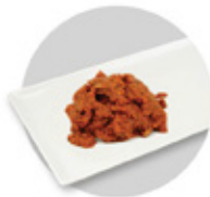
Walnut Chili Dip (Muhammara) GURMESP-703