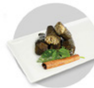
Premium Stuffed GURME532