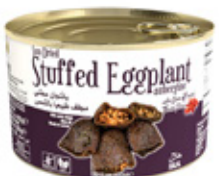
Sun Dried Stuffed Eggplant