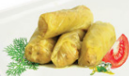
Stuffed Cabbage Leaves

Code : GURME535-GURME534-GURME533-GURME532-GURME530 Type : Packaging : Tin Shelf Life : 24 Months - 36 Months Storage Conditions : +25°C