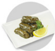
Original Stuffed GURME530