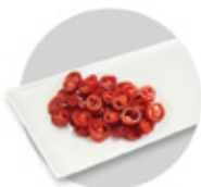
Red Sliced GURMESP-408RWR