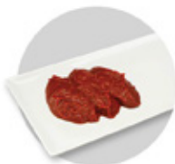
Cherry Pepper Dip GURMESP-701