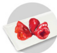
Cardoula Pepper GURME422K