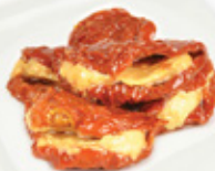
Sun Dried Tomato