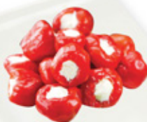
South African Pepper