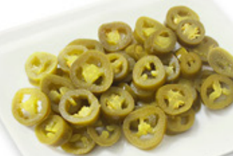
Green Jalapeno Pepper