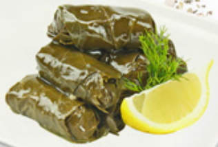
Original Stuffed Grape Leaves