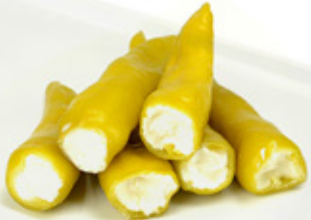
Feta & Cream Cheese Stuffed Macedonian Pepper