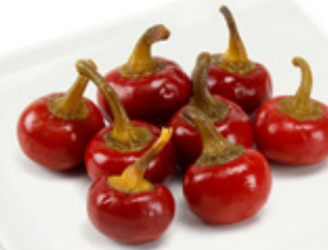
Chili Cherry Pepper