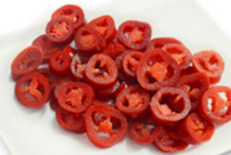
Red Jalapeno Pepper