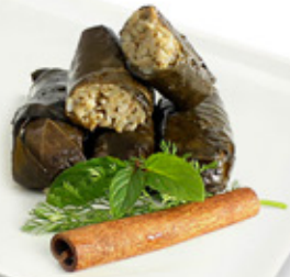
Premium Stuffed Grape Leaves