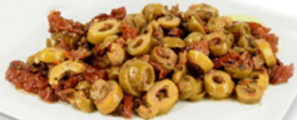
Olives with Sun Dried Tomato