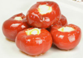
Feta & Cream Cheese Stuffed Red Cherry Pepper