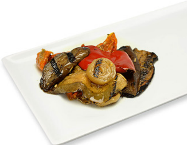
Marinated Mix Vegetables