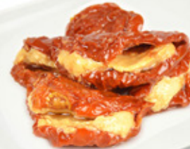
Feta & Cream Cheese Stuffed Sun Dried Tomatoes