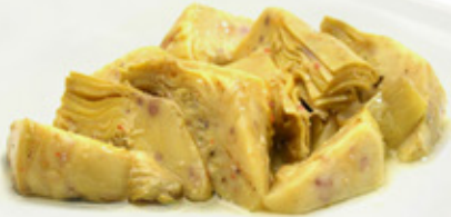
Grilled Artichoke Quarters