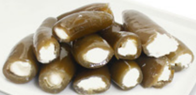
Feta & Cream Cheese Stuffed Green Jalapeno Pepper