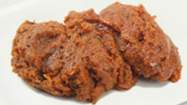
Roasted Tomato Dip