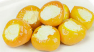
Feta & Cream Cheese Stuffed Yellow Cherry Pepper