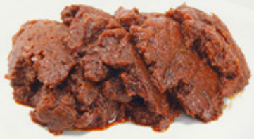
Capers Black Olive Dip