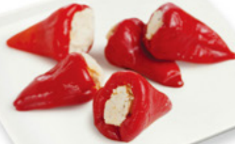
Feta & Cream Cheese Stuffed Kardoula Pepper