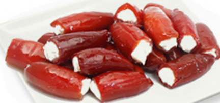
Feta & Cream Cheese Stuffed Red Jalapeno Pepper