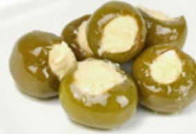
Feta & Cream Cheese Stuffed Green Cherry Pepper