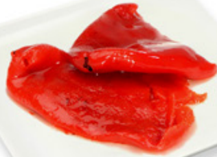
Roasted Red Pepper