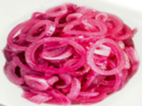
Pickled Red Onion