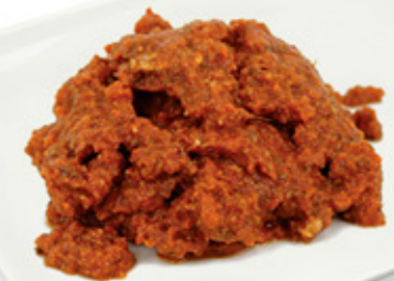
Walnut Chili Dip (Muhammara)