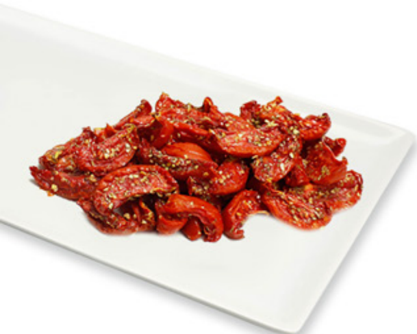
Marinated Semi Dried Segment Tomato