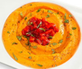
Hummus with Chargrilled Pepper