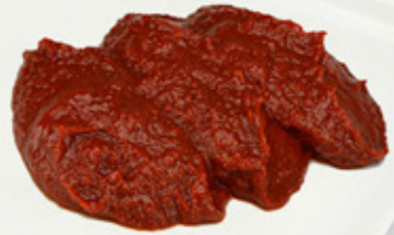
Cherry Pepper Dip