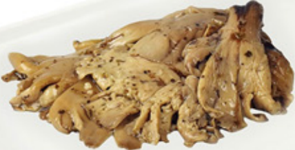
Chargrilled Oyster Mushrooms