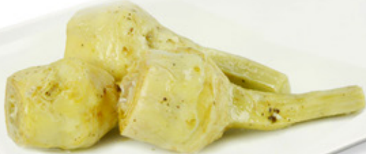
Marinated Artichoke with Stem