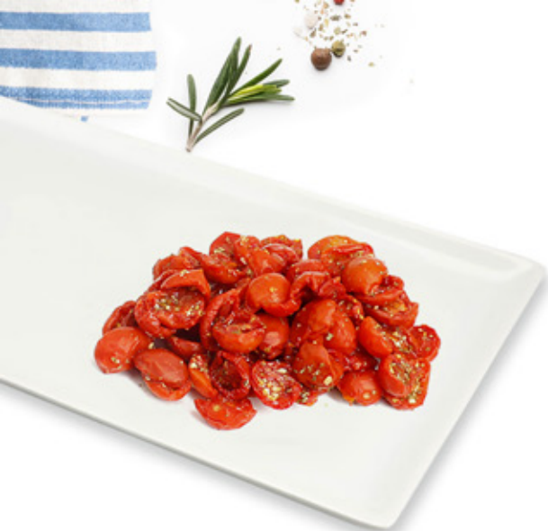
Marinated Semi Dried Cherry Tomato