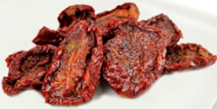
Marinated Sun Dried Tomato