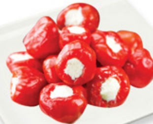
Feta & Cream Cheese Stuffed South Africa Pepper